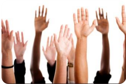
J1000: a major involvement track

visiting hours. Organization of J1000: a major involvement track with children, youngsters, citizens, midfield etc. so as to map the needs and necessities in the scope of child and youth-friendly city (paying particular attention for involving vulnerable children and youngsters as well as various target groups). This event will include a youth congress during the Child in the City conference and a closing moment during 2017.