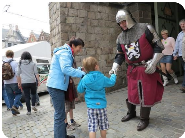
Child -friendly tourism