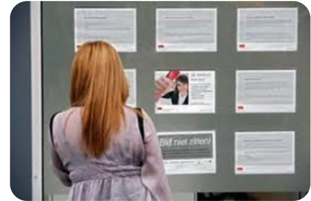
Tackling youth unemployment