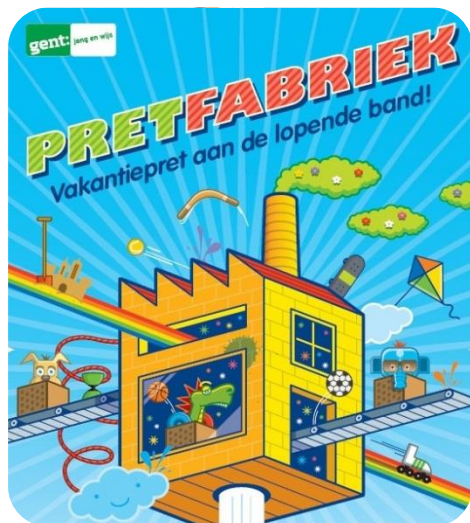
Extending vacation offer: de pretfabriek