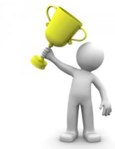
Jong en Wijs price