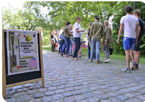
Studentenvieruurtje Saint-Pieters abbey