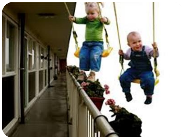
Encourage family-friendly homes