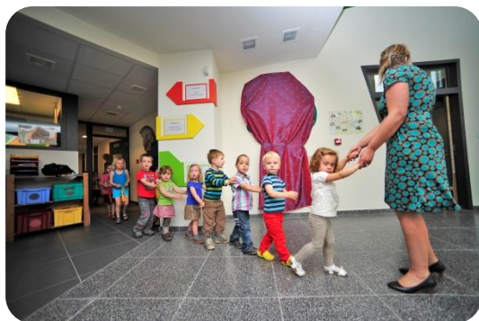
Opening STIBO 't Groen Drieske