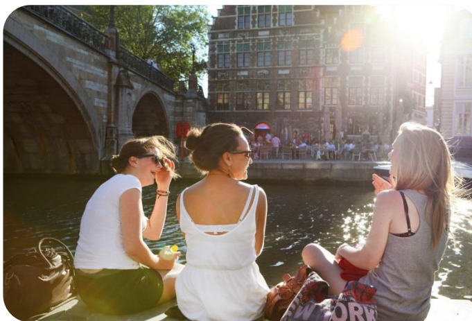
Atmosphere at the Graslei