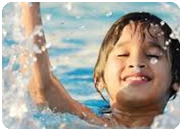
Expansion free youth sports and swim for free under 6 years