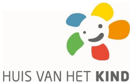
Startup of 'Huizen van het Kind'