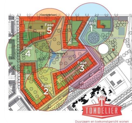
Sports hall at Tondelier