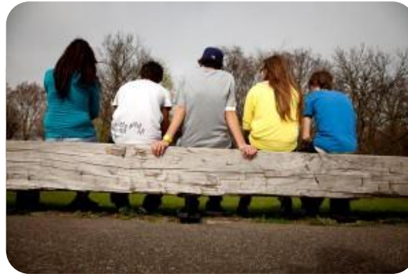
Outreached werken naar NEET-jongeren (not in employment, education or training)