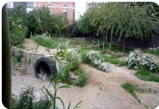
Realization of GRAS (BS De Oogappel)

Achieve greenery and adventurous playing fields by granting a subvention and offering intrinsic support to schools. Extend the number of local sporting fields with additional fitness appliances, ping-pong tables, etc.