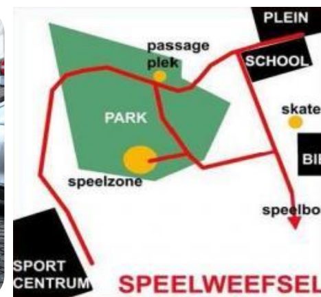
Realizing playing areas in urban renewal projects and child itinerary