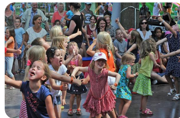
Child-friendly Gentse Feesten