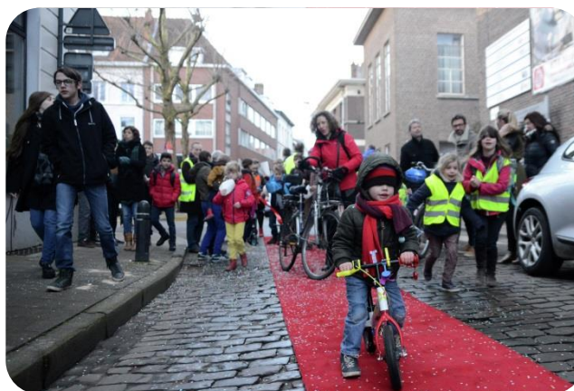
Efforts on safety of school environments