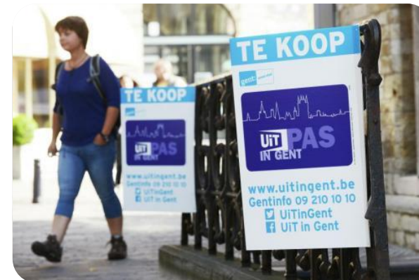
Chance fee free time for children and young people in poverty