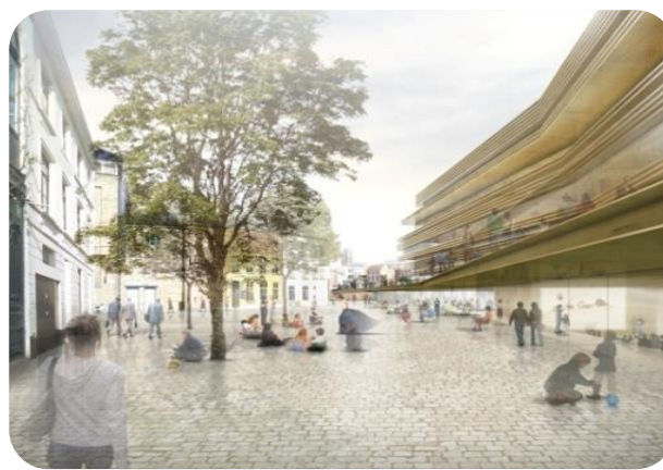
New bib at de Krook