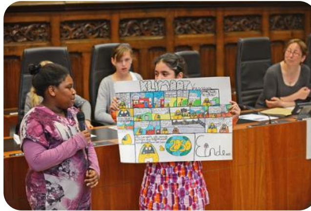
Kids climate council