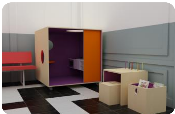
Design children's corner Wondelgem