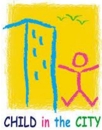
Child in the City Congres in Ghent in 2016