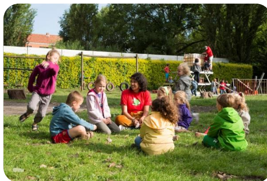
Holliday activities Pretfabriek