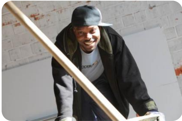
Actions in the context of entrepreneurship and entrepreneurship in secondary education