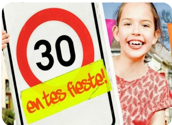
Expansion zone 30 and doubling pedestrians area