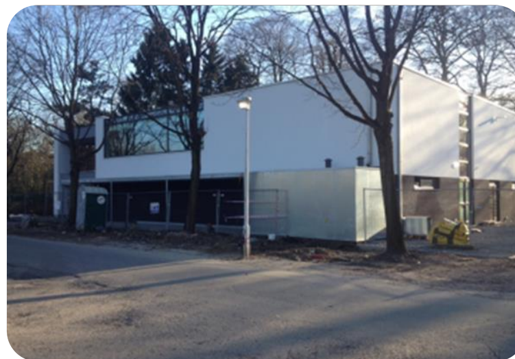
Nieuwe party hall in Wondelgem