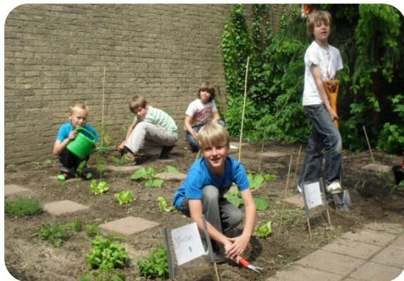
Experimental projects in schools