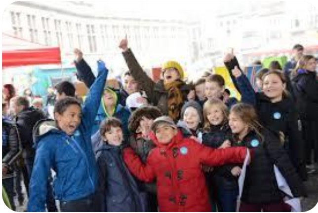
Promoting children's rights